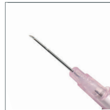
• Safety Catheter single entry w/o wings