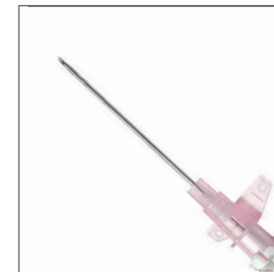
• Safety Catheter single entry w/wings